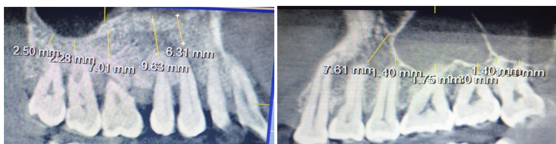
Fig. 3: Vertical measurements of the apices of maxillary posterior teeth (maxillary first premolar, second premolar, first molar and second molar) with floor of the maxillary sinus