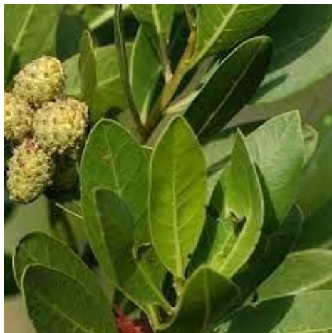
Fig. 1: C. lancifolius fruits and leaves