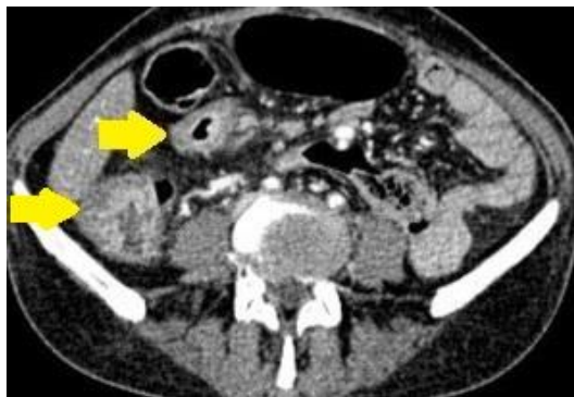
Fig. 1: CT of the abdomen and pelvis showed ileocolic parietal thickening