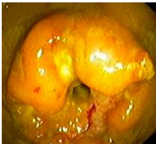
Fig. 2: Colonoscopy showing a mamelonated mass of a stenosing nature in the ascending colon